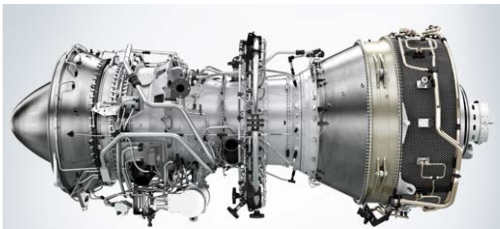
45-MW class core engine derived from the Industrial Trent 60

Note: Nominal performance shown. Performance guarantees are only provided in individual project proposals based on specifications given. Nominal performance shown referred to sea level, 60% relative humidity, natural gas fuel, zero installation losses.